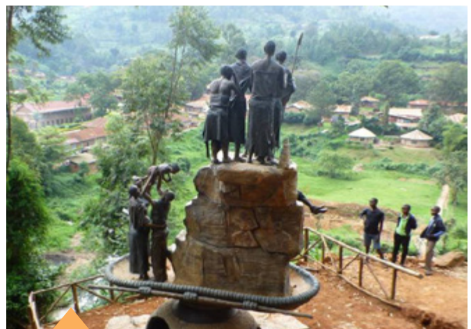
The Kisiizi Falls monument

The project enables local people to earn an income from tourism through selling goods and services to tourists, and further, a part of the income generated from tourism will go to the Good Samaritan Fund that caters for the health costs of disadvantaged community members, who otherwise would not be able to afford medical care.