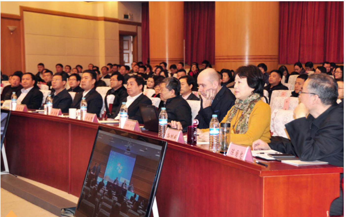
Participants of the 2-day seminar in Jinan, China

As a follow-on activity to the 2-day seminar, a high-level training on the implementation of the Tourism Development Master Plan will be delivered on 28 April 2017, specifically for the Vice Mayors from all 17 cities in the province.