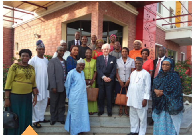
Photo with the President and members of the Federation of Tourism Associations of Nigeria

This would enable the Ministry to have a new Master Plan which would provide the guiding framework for the dynamic yet sustainable development of the tourism sector in the country, and it would also build the capacities of middle to senior management of the Ministry and other Government institutions in the development and management of the sector in accordance with the recommendations of the Master Plan.