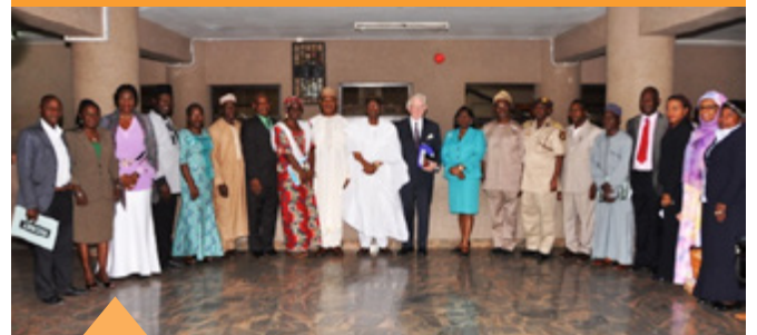
Photo with the Honourable Lai Mohammed, Minister for Information and Culture of Nigeria and government and industry representatives