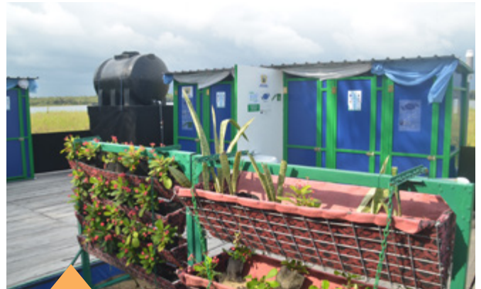
Toilet stalls built by the project for Nzulezu village

The Adventure Park completed in time for the opening of the ski season in Jahorina in mid-December.