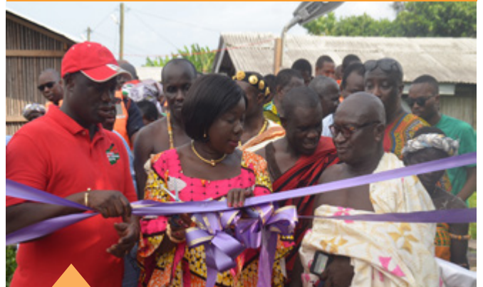
Hon. Elizabeth Ofosu-Adjare, Minister of Tourism, Culture and Art of Ghana at the project closing ceremony